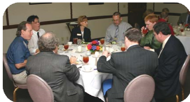
Advisory Council Luncheon and Student Reception

American National Insurance Elliott Electric Supply ExxonMobil Global Services Company Focus POS Systems Lufkin Industries (charter member) Pepsico Business Solutions Group/Frito-Lay Texas Instruments, Inc. (charter member) VALIC xlrnt, LLC