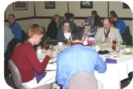
UPE Initiation Banquet

UPE is the International Honor Society for the Computing and Information Disciplines, founded at Texas A&M in 1967. The SFA Chapter of UPE was formed in March of 1975.