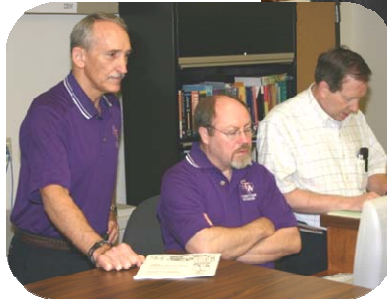
CSC Club Programming Contest

The Computer Science Club brings students together that have an interest in computing. A variety of events are sponsored by the club each year including guest speakers, picnics, field trips, LAN parties, and programming contests.