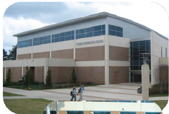
Student Recreation Center