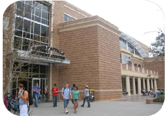
Baker Patillo Student Center

Department of Computer Science PO Box 13063 Nacogdoches, TX 75962 Phone: (936) 468-2508 Email: csdept@cs.sfasu.edu www.cob.sfasu.edu/csc