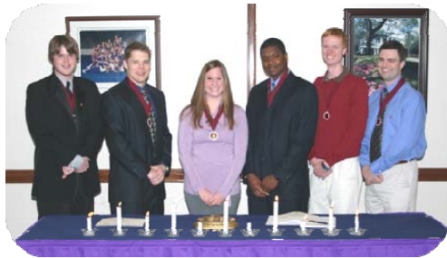
UPE Officers and Initiates

UPE is the International Honor Society for the Computing and Information Disciplines, founded at Texas A&M in 1967. The SFA Chapter of UPE was formed in March of 1975.