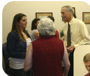
Reception for Scholarship Recipients

The SFA Alumni Association administers a number of alumni scholarships created by graduates of the Department of Computer Science.